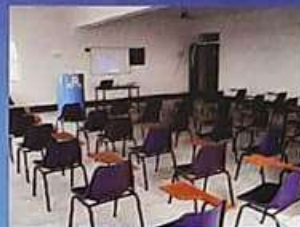
JPSPM CONFERENCE HALL